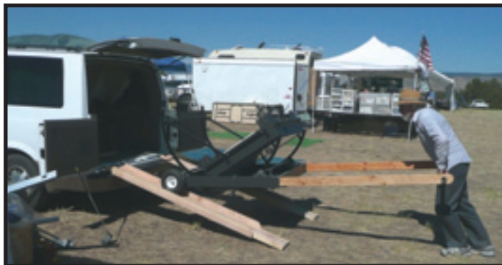
The rocker/mirror box assembly can be ramped up into a mini-van with the included handles/wheels.

The cordless hand control provides several functions. A three-speed slew in both axes gives complete control over the slewing motions of the scope. You can quickly go from one part of the sky to another with the fast speed, center an object in the field of view with the medium speed, and fine-tune centering at high power or on a laptop screen